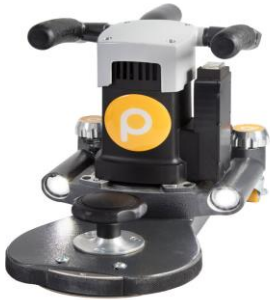
Frank Gecko Star 2.0 Edger sander