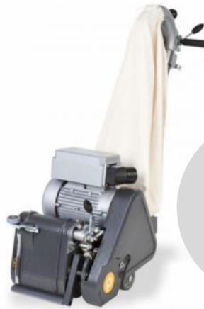
Frank Python 10 inch Belt Sander

For more information or to arrange a demonstration call your local Distributor