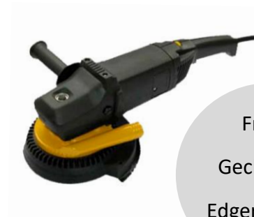
Frank Gecko Flex Edger Sander