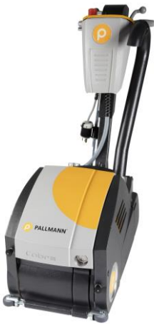
Frank Cobra 8 inch Belt Sander